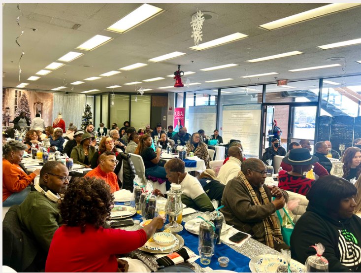
(Attendees enjoying our Stakeholders Breakfast)