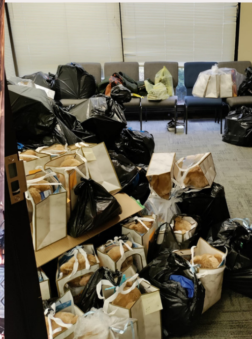
(Bringing Joy to the Community Christmas Gift Recipients)