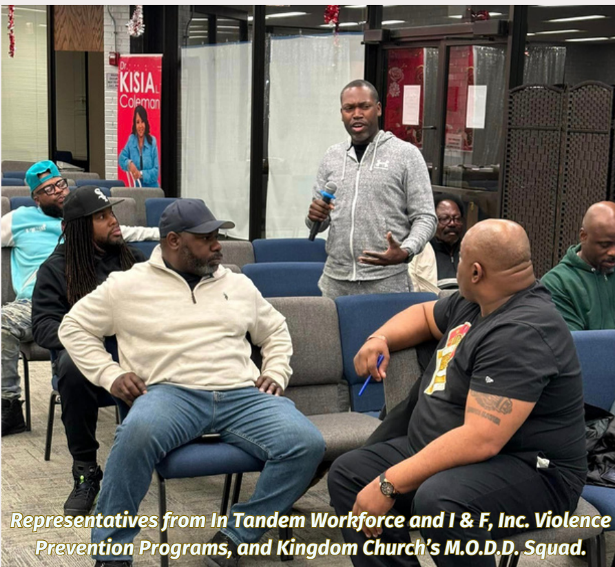
Representatives from In Tandem Workforce and I & F, Inc. Violence Prevention Programs, and Kingdom Church's M.O.D.D. Squad.